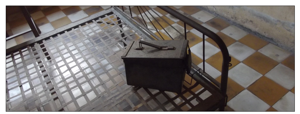
Steel bed that prisoners were shackled to, and, ammunition box toilet. Tuol Sleng Genocide Museum, Phnom Penh, Cambodia.