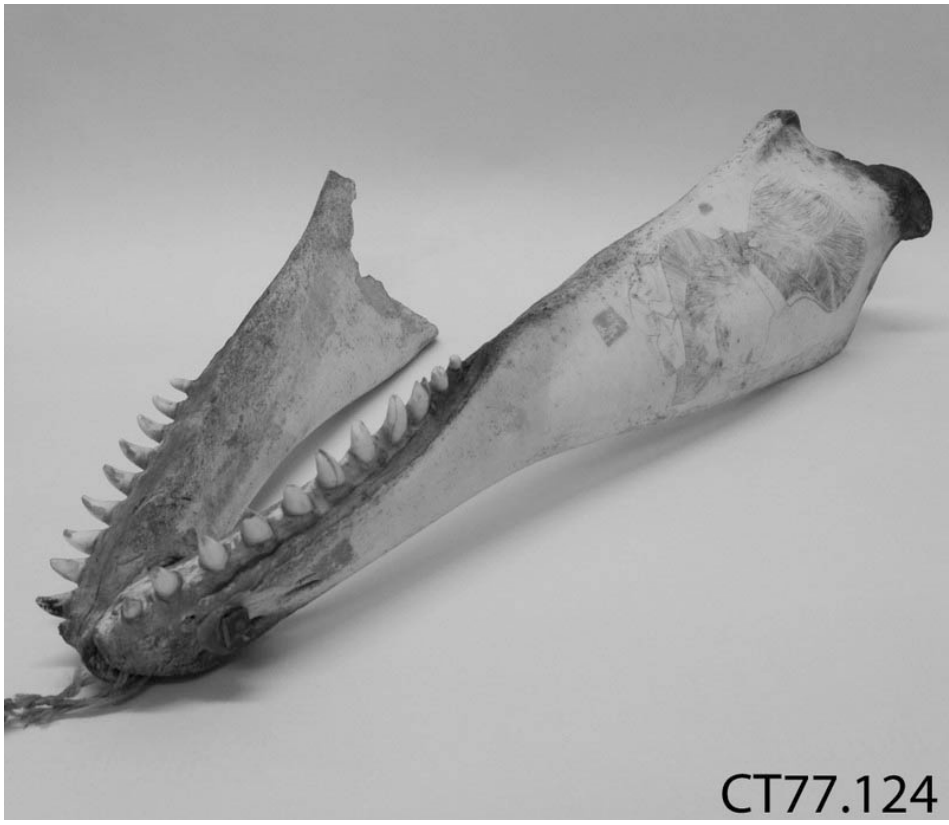
Scrimshaw of trees and floral motifs carved on the lower jaw of a Long-finned Pilot Whale. Item from the Owaka Museum.

Demand for whale bone carvings, as well as a range of other Māori traditional artworks—sometimes even including mokomokai (preserved severed Māori heads covered with tā moko )—fed not only domestic collections but also museums, art galleries and private curiosity cupboards in Australia, North America and Europe. Despite the market for whale bone carving flourishing at a time where it could feed off a byproduct of the Pākehā-led whaling industry it is clear that Māori possessed a deep cultural history of using whales in that way prior to European settlement. It should also be noted that the designs in the period after the introduction of commercial whaling include little variation from earlier pieces.