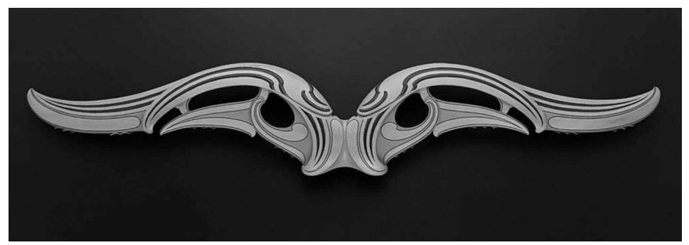
'Tutarakauika—Guardian Whale' by Todd Couper http://www.spiritwrestler.com/catalog/index.php?artists_id=9

is deeply significant to New Zealanders and has been an inspiring element in a range of modern cultural texts, including Witi Ihimaera's critically acclaimed novel the Whale Rider (1987) and Niki Caro's award winning film of the same name (2002).