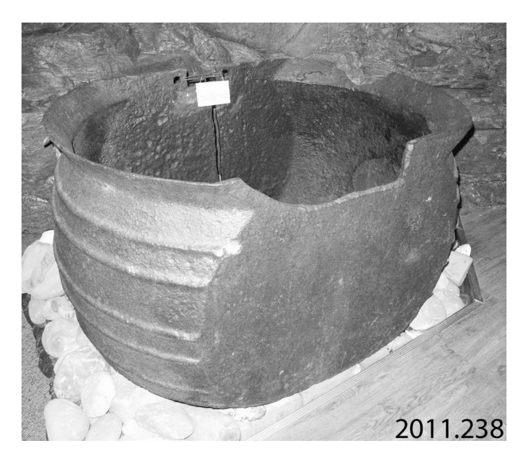
Try pot (2011.238)—from the Tautuku station and used between 1839 and 1843. (Try pots were used to remove and render cetacean oil from blubber. Sometimes these were also used on pinnipeds and penguins. The flat sides allowed them to fit closely together and to conserve heat.) Item from the Owaka Museum.

whale's fluke and sank. All bar Chaseland and two other men drowned—with the three of them holding onto a piece of wreckage to stay afloat. Eventually—with a heavy fog setting in—Chaseland set off swimming, volunteering to seek help from shore. A boat eventually rescued the other two men but no one could locate Chaseland until sometime later when he was spotted coming up to shore, naked, having swam six miles back to the station.<sup>25</sup>