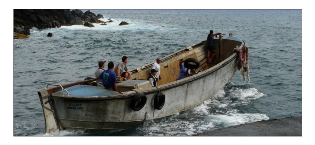
Figure 4. Pitcairn longboat (author photo 31 August 2008).