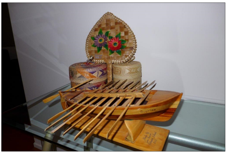
Figure 5. Replica Surprise longboat and Pitcairn crafts (4 May 2017).

carver (Figure 5). Boats of such intricate detail had not been made for many years and it stands in pride of place in our Dunedin home.