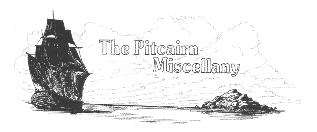
Figure 1. Masthead of Pitcairn Miscellany newsletter depicts image of 'land and sea' and Bounty heritage.

My own visits to Pitcairn bear out Ford's comment. Indeed, many a captain did divert his ship for a 'look-see' at this 'fabled' island and its inhabitants. More contemporarily, one of the most influential sources is the Pitcairn Miscellany (PM) (Figure 1) produced monthly since 1959.<sup>2</sup> PM serves as a social network of family, friends, and interested Bounty 'buffs' worldwide. Its most significant feature is in recording the routine of Pitcairn life; the minutiae of day-to-day social behaviour is documented in the emotive, (via islander narratives, poems and stories, obituaries), the political (via Council meeting reports), communal (public work, school events, church activities), food gathering activities (gardening, fishing) and economic (carving and weaving, trade with visiting ships) as well as observations of opinion, gossip, rumour, innuendo, disagreements, humour, alliances between kin groups, friendships and interactions. These are the socially shared means whereby Pitcairners construct their social worlds and from which the ethnographer interprets Pitcairn society.