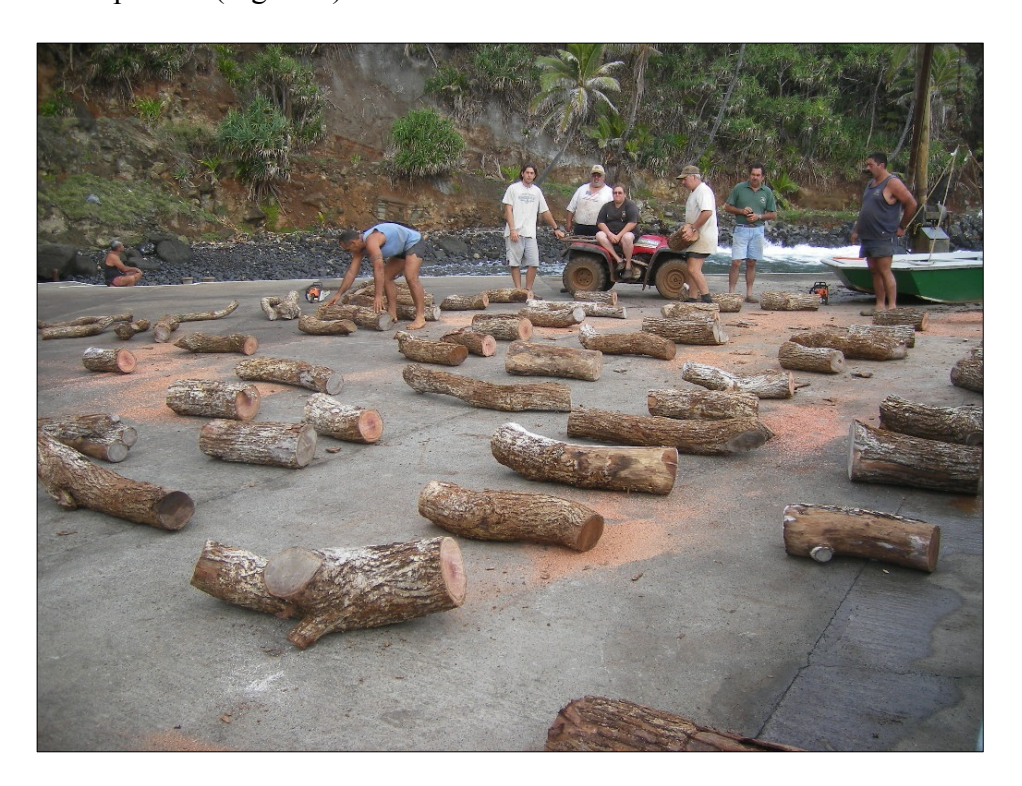
Figure 3. Miro wood share out (author photo taken 14 April, 2011).

longboat, a process that took several days. So, when this wood was gifted to the community, the traditional 'share out' practice was maintained. The wood was cut to even sizes and each man, women and child were allocated their portion (Figure 3).