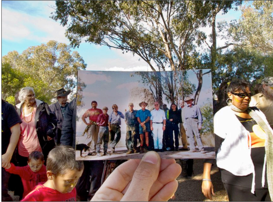
Myall Creek Memorial Day Walk 2012. Photograph taken by Brendan Blacklock https://open.abc.net.au/explore/22433