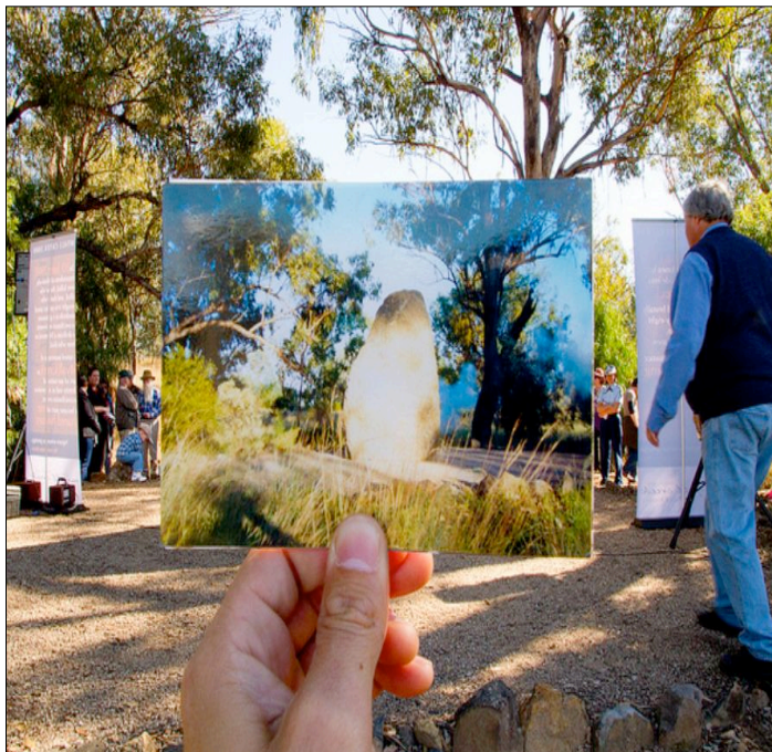
Gathering around the Memorial stone.