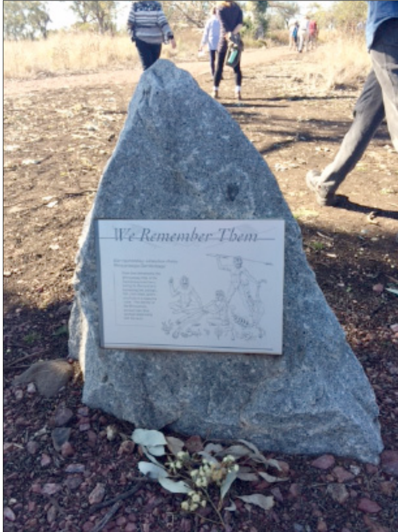
Myall Creek Memorial Walk, 7 June 2015.