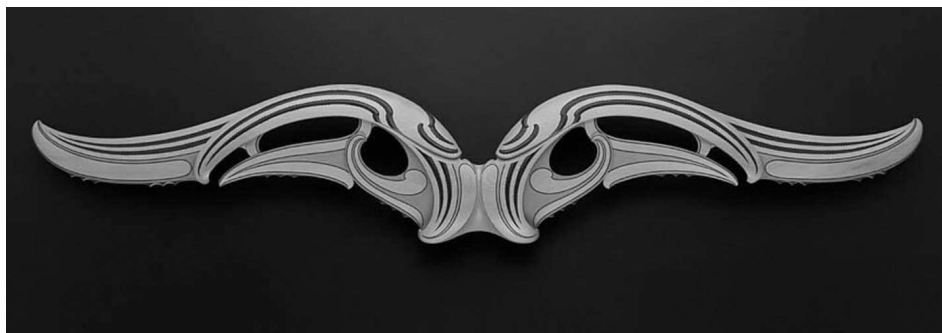
'Tutarakauika—Guardian Whale' by Todd Couper http://www.spiritwrestler.com/catalog/index.php?artists_id=9

is deeply significant to New Zealanders and has been an inspiring element in a range of modern cultural texts, including Witi Ihimaera's critically acclaimed novel the Whale Rider (1987) and Niki Caro's award winning film of the same name (2002).