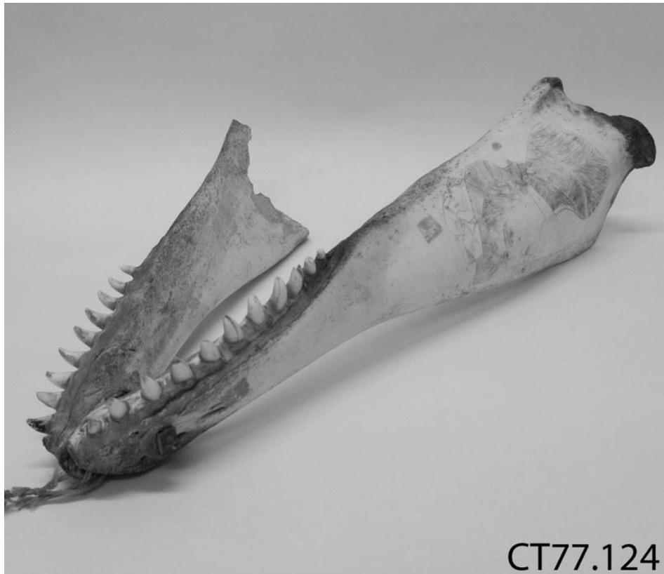
Scrimshaw of trees and floral motifs carved on the lower jaw of a Long-finned Pilot Whale. Item from the Owaka Museum.

Demand for whale bone carvings, as well as a range of other Māori traditional artworks—sometimes even including mokomokai (preserved severed Māori heads covered with tā moko )—fed not only domestic collections but also museums, art galleries and private curiosity cupboards in Australia, North America and Europe. 28 Despite the market for whale bone carving flourishing at a time where it could feed off a by-product of the Pākehā-led whaling industry it is clear that Māori possessed a deep cultural history of using whales in that way prior to European settlement. It should also be noted that the designs in the period after the introduction of commercial whaling include little variation from earlier pieces.