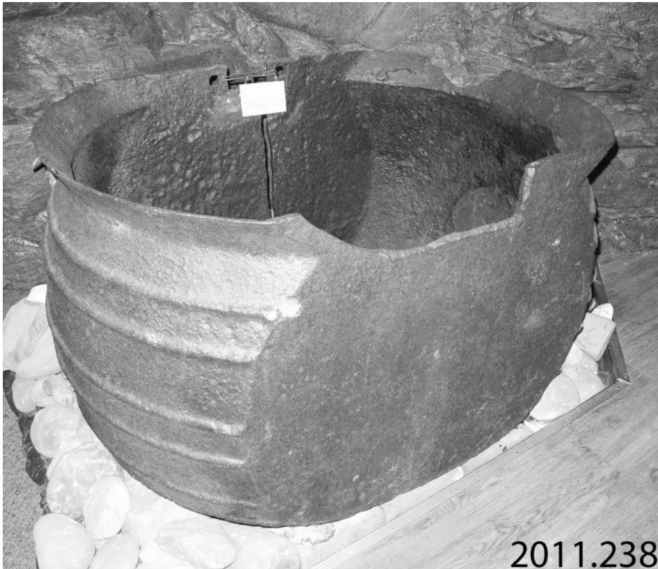
Try pot (2011.238)—from the Tautuku station and used between 1839 and 1843. (Try pots were used to remove and render cetacean oil from blubber. Sometimes these were also used on pinnipeds and penguins. The flat sides allowed them to fit closely together and to conserve heat.) Item from the Owaka Museum.

whale's fluke and sank. All bar Chaseland and two other men drowned—with the three of them holding onto a piece of wreckage to stay afloat. Eventually—with a heavy fog setting in—Chaseland set off swimming, volunteering to seek help from shore. A boat eventually rescued the other two men but no one could locate Chaseland until sometime later when he was spotted coming up to shore, naked, having swam six miles back to the station. 25