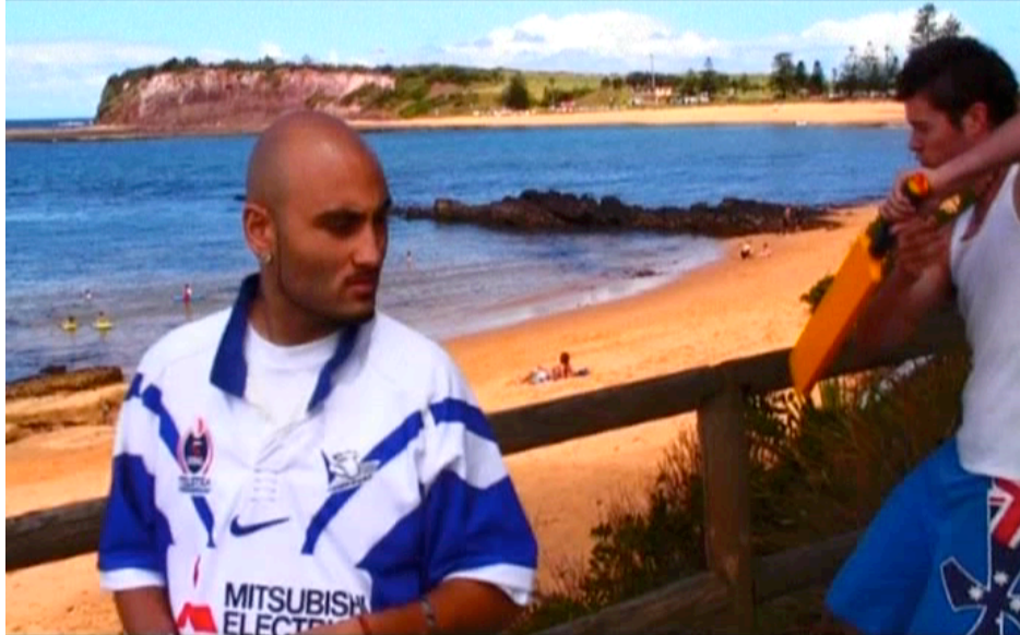
Still from 'Between the Flags', Tropfest Short Film Festival, 2007. The clothing of the two characters reflects their intended identities: the Australian flag on the shorts of one; the other in the [Lakemba area's] Canterbury Bulldogs rugby league jersey, with its message a mix of loyalties—for sport, team, suburb, community and indirectly for [Islamic] religion.