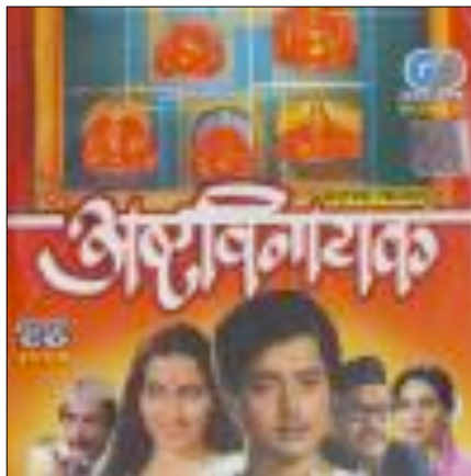
Figure 4: Poster of the film Sai Baba, Ashtavinayak , 1979.

It was hard to imagine that a village of 200 houses at the beginning of the century would become one of the most frequently visited pilgrimage sites. According to a rough estimate, more than six million pilgrims visited Shirdi in 2010 (Shinde, 2010). The local community honored one of the lead actors in the film, for his contribution in popularizing Shirdi and Sai Baba, as they renamed the main street adjacent to the temple after him.