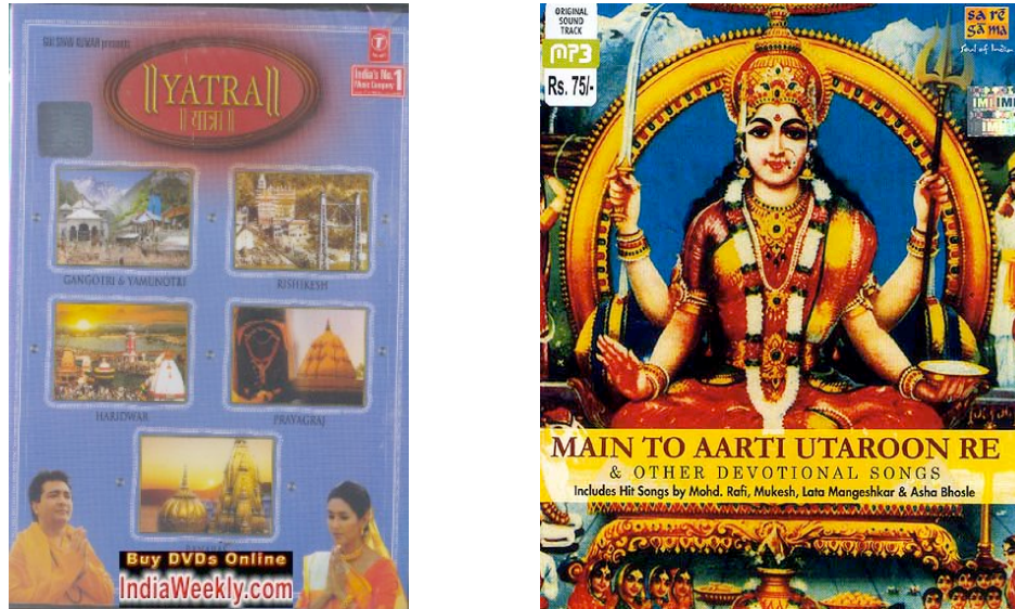
Figure 5. Devotional music presented in cassette and cd format.

The foray of religious functionaries, priests and gurus in this industry signaled a new era in contemporary religious practice (Shinde, 2010). Their impact on devotional music industry is nothing less than spectacular. For instance, In Vrindavan, a music company established by a religious guru claims to ‘own 3,500 titles of which a minimum of 10 have been 10 million sellers, and over 15 have grossed more than 5 millions in sales and another 20 have bagged sales of about a million’ ( http://mridulvrindaban.com ). According to this performer the inspiration to do so has come from a ‘divine dream’, one in which he was summoned and directed by Krishna to make his legend accessible to people who are unable to attend the cultural performances in Vrindavan. When such music is played, it keeps reminding the listener of the glory of the deity and of how ordinary people can also benefit by undertaking religious travel to seek darshana and the blessing of the deity. The business of Video CDs and audio CDs is supplanting the traditional medium of religious scriptures and texts and in no small measure, almost acquiring a folkloric proportion.