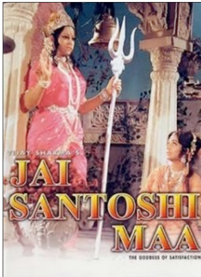
Figure 2: Poster of a subsequent film on Santoshi Maa.

One of the earliest films that exemplify this category is Jai Santoshi Maa . Since its release in 1975, the film almost has had a hysteria-arousing effect. A poster of this film is shown in figure 1. The story is about a newly wed bride whose life is made miserable by her in-laws and social pressures, but who finds a deity in the form of devi Santoshi (goddess of satisfaction) and decides to worship her. In the final analysis, her devotion wins over all the evils. The movie was particularly appealing for female audiences, even as it also struck a chord with and conveyed a message of vindication and ultimate triumph for the sincerely devoted. Consequently, several stories of miracles were reported many women folk who, in real life, began to worship devi Santoshi. There were more and more people attracted to the temples of the goddess and even new ones were built. The stories of Santoshi Maa (mother) are being retold in newer formats and sequels have been produced.